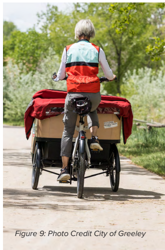
Figure 9: