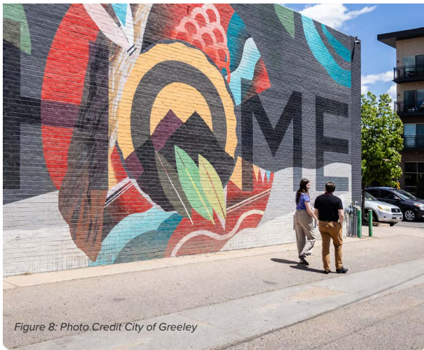
Figure 8: Photo Credit City of Greeley

Whether you're exploring local history, appreciating public art or attending a world-class performance, Greeley combines outdoor adventure, cultural vibrancy and a welcoming spirit.