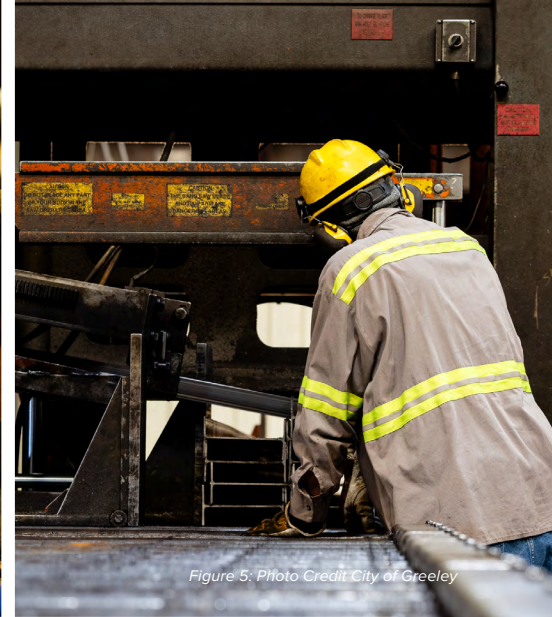
Figure 5: Photo Credit City of Greeley