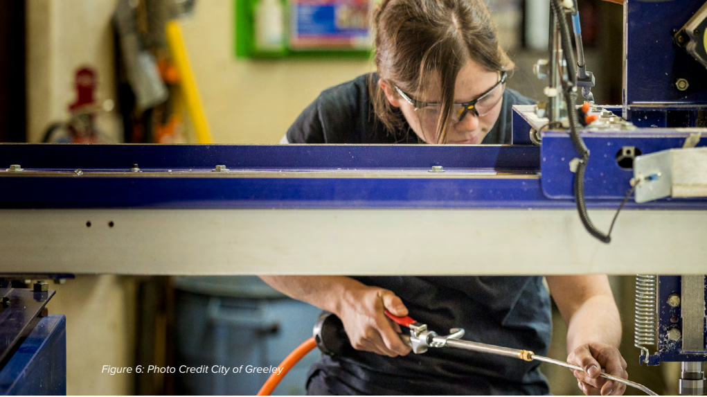
Figure 6: Photo Credit City of Greeley