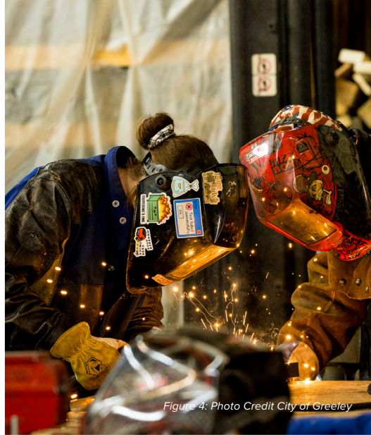
Figure 4: Photo Credit City of Greeley