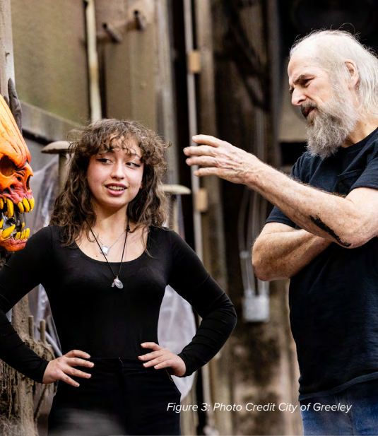
Figure 3: Photo Credit City of Greeley