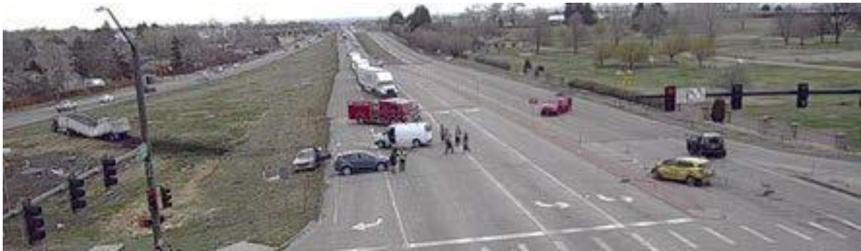
Image 1: Crash between Multiple Vehicles at US Highway 34 and 35th Avenue - MERGE Site

The MERGE project will eliminate a significant mobility barrier and safety concern for active transportation users (at-grade crossings are used heavily by students walking, rolling, and biking) which, when coupled with other multi-modal improvements, will further enhance corridor mobility. The regional bus station at the center of US 34 between interchanges will facilitate a higher level of shared commuting to Denver and the Denver International Airport via Bustang and Flex which connects to Boulder and Fort Collins (as shown in Figure 2 ). Additionally, the Greeley Evans Transit (GET) will operate a bus service with direct connectivity between the Greeley mobility hub and the transit hub in Loveland. A proposed shared-use underpass of US 34 supports regional trail connectivity in all directions and provides access to the transit station. The combination of new grade-separated interchanges, regional and local transit service, and active transportation infrastructure will reduce the number of cars on the road leading to a reduction in emissions, vehicles operating costs, and wear and tear on state and local infrastructure ( 6% reduction in AADT is expected ).