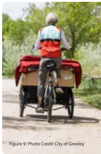
Figure 9: